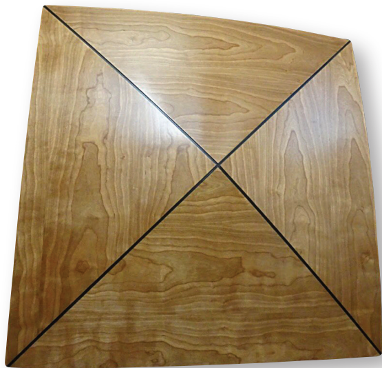
Typical Ceiling Detail